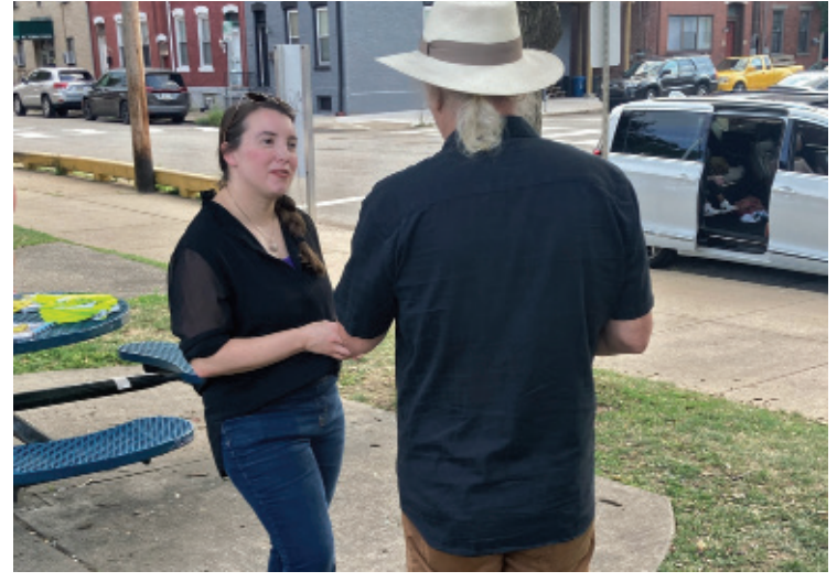
I made some new friends at the National Night Out Parties in the Beechview (left) and the South Side Flats (right).