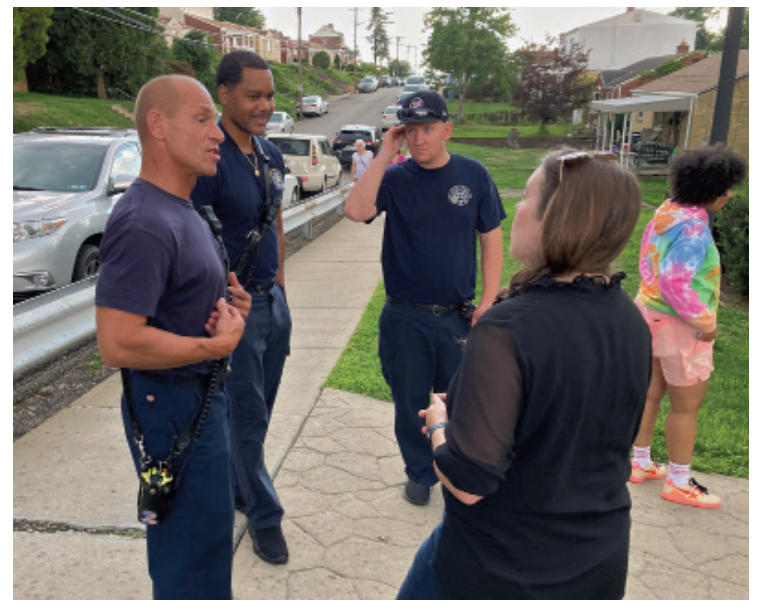
First responders are some of the hardest working people in our community – and their input is crucial to learning how we can better support their efforts. I'm happy I got the chance to chat with Pittsburgh Firefighters at the Bon Air National Night Out Party.