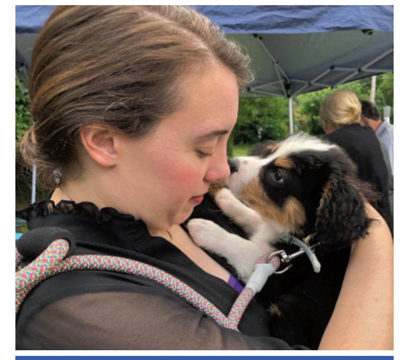
I love meeting the members of our community – especially ones with fur! It was a pleasure to greet this pup at the Mt. Oliver City / St. Clair National Night Out Party.